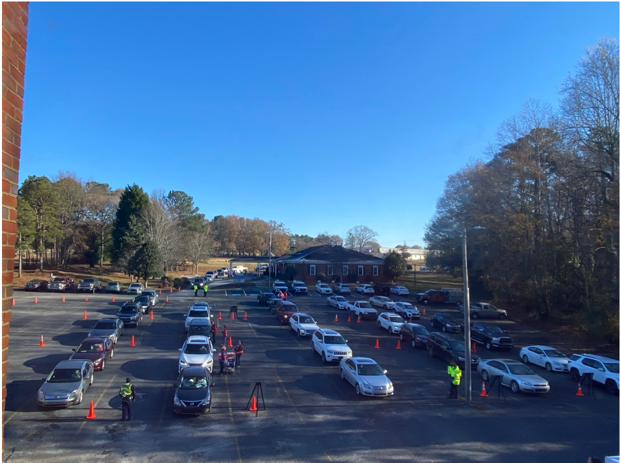
Spalding County Health Department Vaccine POD

Frequently asked questions about COVID-19 vaccines.